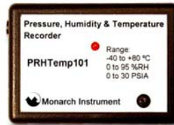
PRHTemp 101 pressure, humidity and temperature recorder

Sample of different configurations and parameters...call for a complete list of compact data loggers.