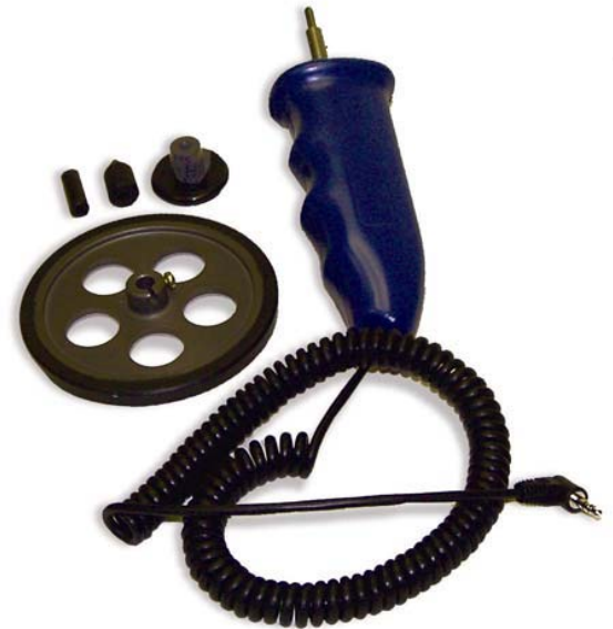
Remote Contact Assembly with 8 ft (2.5 m) cable, contact tips and two linear speed wheels (12 inch wheel sold separately)